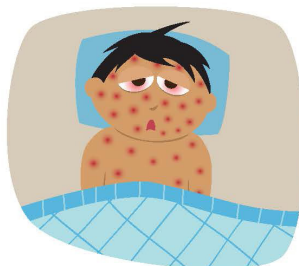
a rash, and red watery eyes